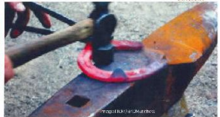
MSU Farrier School