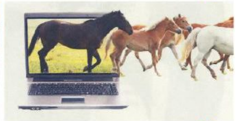
National online horse management program reaching over 500,000 horse enthusiasts MyHorseUniversity.com