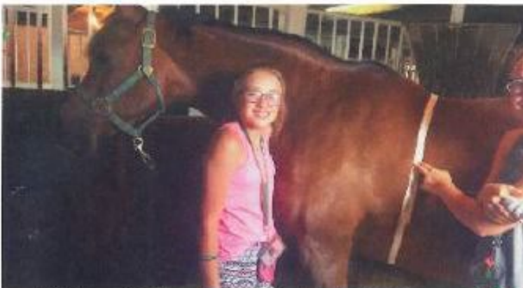
Michigan 4-H Horse Program develops leadership, responsibility, and communication skills in 7000 Michigan youth with the help of 1500 volunteers.