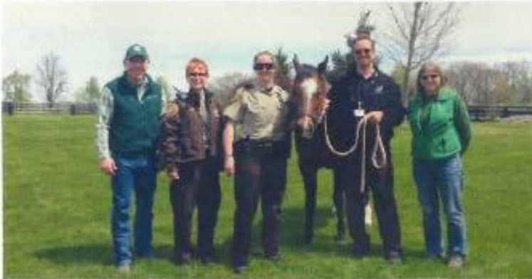
Educating Michigan animal control officers and first responders in horse handling and animal health ERAIL | canr.msu.edu/erail

Impacting Michigan communities through outreach and education