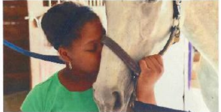
Collaborating with Detroit Horse Power Using the power of horses to expand opportunities for Detroit's children | DetroitHorsePower.org