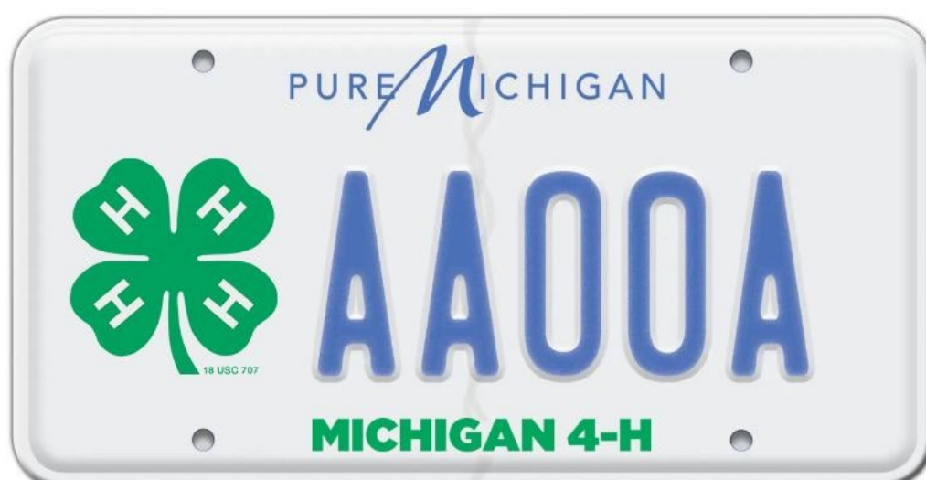
Draft plate; not final version.

The bills will be formally read into the record this week.